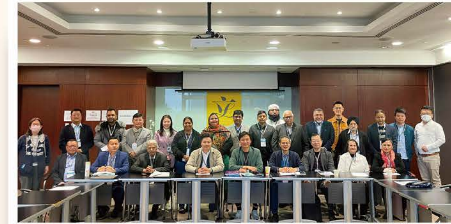
Members of The 10th DAB's Ethnic Minorities Committee

Over the years, EMC has worked hard to help ethnic minorities overcome daily challenges while encouraging them to develop their strengths. The DAB established the Ethnic Minorities Services Centre (EMSC) to provide support and consultation services in the areas of education, employment and housing, comprehensive social security assistance, immigration, family and legal disputes, and medical affairs. Last year, EMSC handled over 300 cases. EMSC also distributed newsletters to ethnic minorities through street stations, sharing messages from the Centre and informing them about government's new policies.